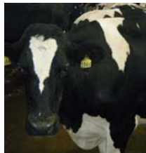
to Farmer Field Schools in Cambodia