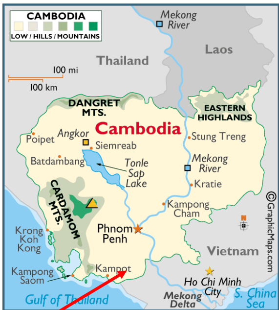
Approximate location of project