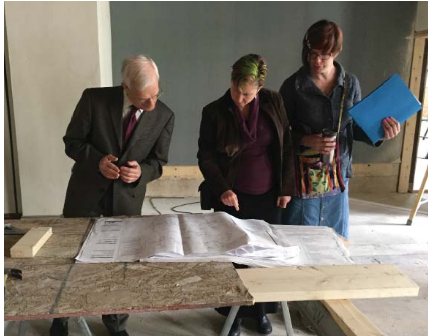
Above left: Fencing was installed around the west side of the church at the end of March, followed by the start of demolition. In early April, Dumpsters along the building collected debris that was carted away prior to the beginning of construction. Above right: During an after-church tour of the Chapel construction on May 21, members perused the plans for remodeling the space. Below left: The Chapel under construction shows the roughed-out area of the kitchen at right. The kitchen, located between the Chapel and the Student Lounge, will facilitate food service at events in both locations. Above the kitchen will be the mechanicals for heating and air conditioning. Below right: During remodeling, the church office has relocated to 320 Lathrop Street, across the street. The Senior and Associate Ministers, the Bookkeeper, and Office Manager are there; other staff remain in their original offices in the church building.