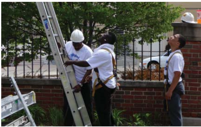
Above: Workers from Inspired Heights, wearing safety harnesses, contemplate the long climb to the roof.