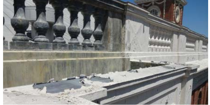
Above: The pillars on the balustrade at left are stripped and ready for new paint, whereas other areas are not yet treated. Below: A worker in a harness approached the balustrade after a long climb up a tall ladder.