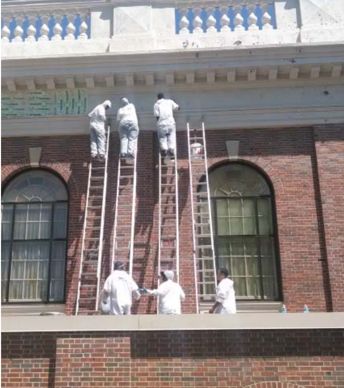
Above: On May 29, workers scaled ladders to strip and prime surfaces before a new coat of paint.

The Reach and Renew Campaign seeks to renew our health by focusing on the congregation's worship, missions, and programs; to renew our hospitality by encouraging the use of our space by outside groups; and to renew our home by making upgrades in our building. The focus in May was the roof and the Youth Room.