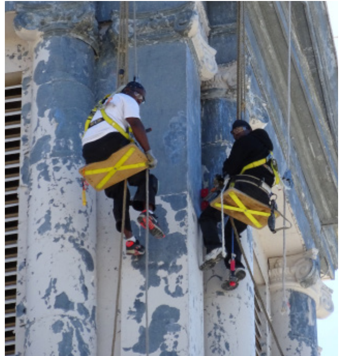
Above right: A pair of workers dangling from bosun's chairs scraped lead-based paint from the big tower this fall. Above left: In October, a worker stood at the very top of the big tower to paint the flourish at the peak, while another worked on the level beneath. Below: Paint chips and other debris had to be continuously removed from the front steps and sidewalk by a worker with an industrial vacuum. The steps themselves will be refurbished next year.